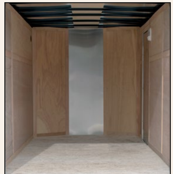
Trailers shown may feature optional equipment available at additional cost.